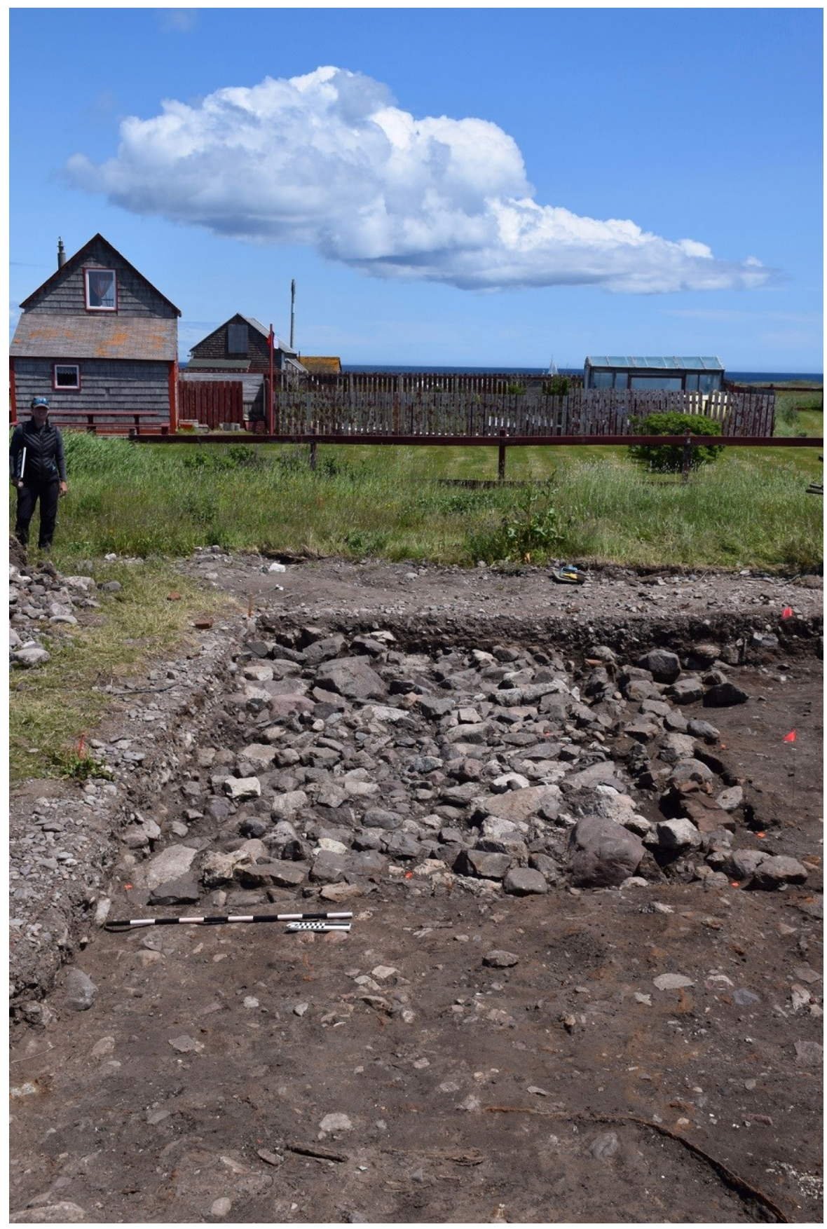
Figure 6: Field Director, Catherine Losier, standing by as the 19th century building feature is thoroughly documented