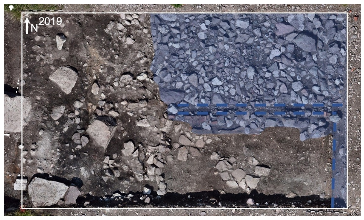
Figure 5: A 3D model of the site's 19th century context excavated during Summer 2019. The archaeological feature outlined in blue marks the foundation of a 19th century structure. The blue dotted line denotes the presence of wooden blanks within this feature