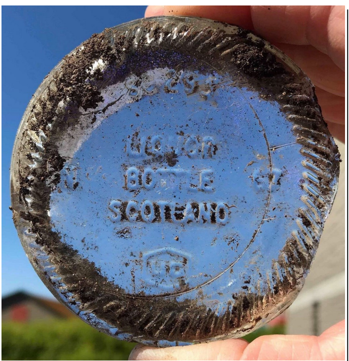
Figure 9: A 1930's Scotch whisky bottle base uncovered in the site's 20th century context, and reminiscent of the archipelago's role as a transhipment point for illegal alcohol during Prohibition.

types of materials and/or objects more easily. Over time, the team no longer observes just the work and occupations of fishermen but can also see evidence of activities and daily lives of entire fishing families. The 19th and 20th century contexts show not only there more people were present at the site, but also now women and children. The 2019 excavations really helped refine the team's understanding of the overall life history and changing fishing practices carried out at the site through time. Catherine, Mallory, and Meghann are very excited to be bringing back the MUN Archaeology Field School for their upcoming 2020 season. Entering the new decade, they are also looking forward to helping commemorate the islands' rich history of smuggling and the 100th anniversary of the Prohibition Era (1920-1933) with their friends and community partners in SPM.