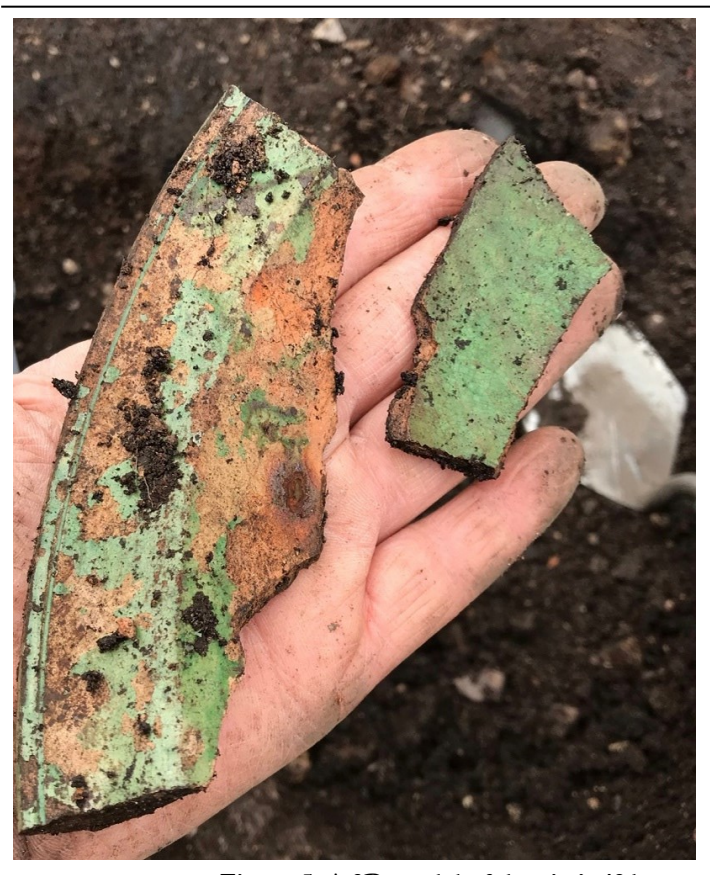
Figure 4: Saintonge coarse earthenware rim sherds uncovered from the site's rich 18th century context